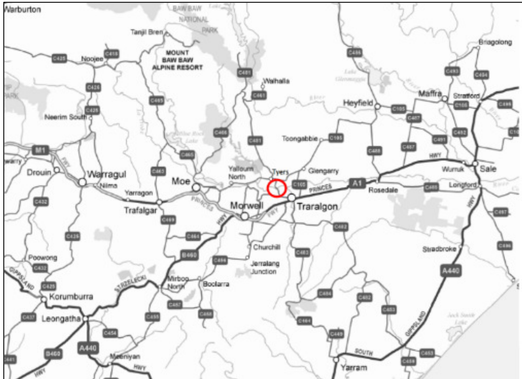
Figure 1 – Project Locality Plan

The project consists of constructing a new three span concrete bridge over the Latrobe River and removing the old structure and improvements to the Tyers Road alignment at both ends of the new bridge through road widening and straightening.