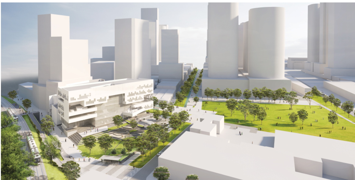
Artist impression – subject to change

The opening of the new primary school in Term 1, 2018 will be a major step in the transition of the Montague area from industrial to a mixed-use precinct supporting residents, businesses, education and community services.