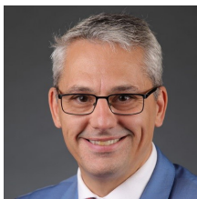
The Hon. Danny Pearson MP Assistant Treasurer, Minister for Transport Infrastructure, Minister for Suburban Rail Loop, Minister for WorkSafe and the TAC

Danny Pearson is the Member for Essendon in the Victorian State Parliament, first elected in 2014 and re-elected in 2018. Danny brings extensive experience in government oversight and leadership to his roles, having served as Chair of the Public Accounts and Estimates Committee from 2014 to 2018 and as Parliamentary Secretary to the Premier from 2019 until June 2020.