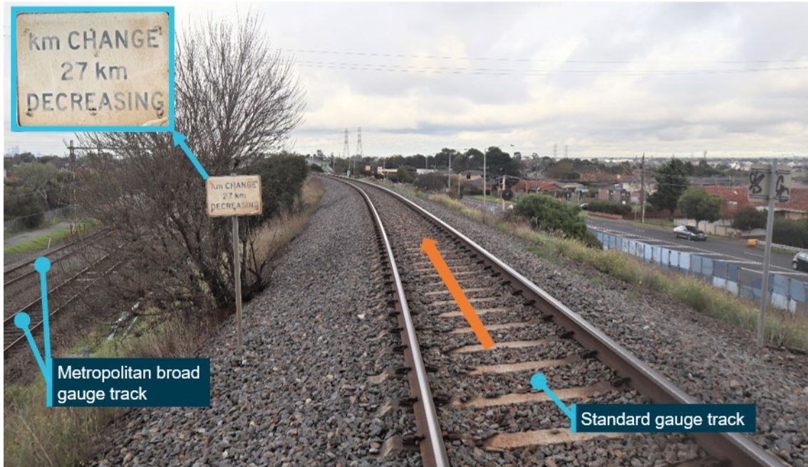
Figure 3: Kilometre change signboard after track passed over the broad gauge lines

The figure shows the standard-gauge track a short distance after it had passed over the broad gauge tracks (at the Jacana Flyover)