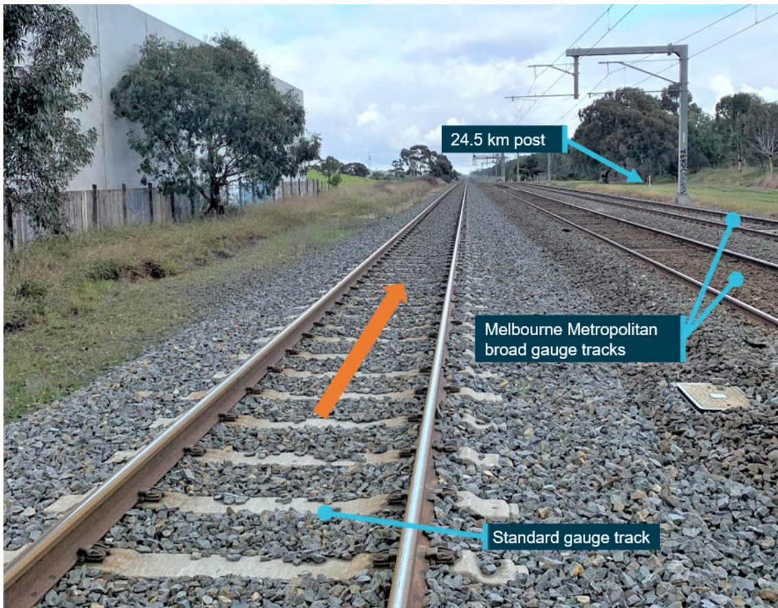
Figure 2: Looking towards 24.4 to 24.0 km location where ST21 reduced speed.