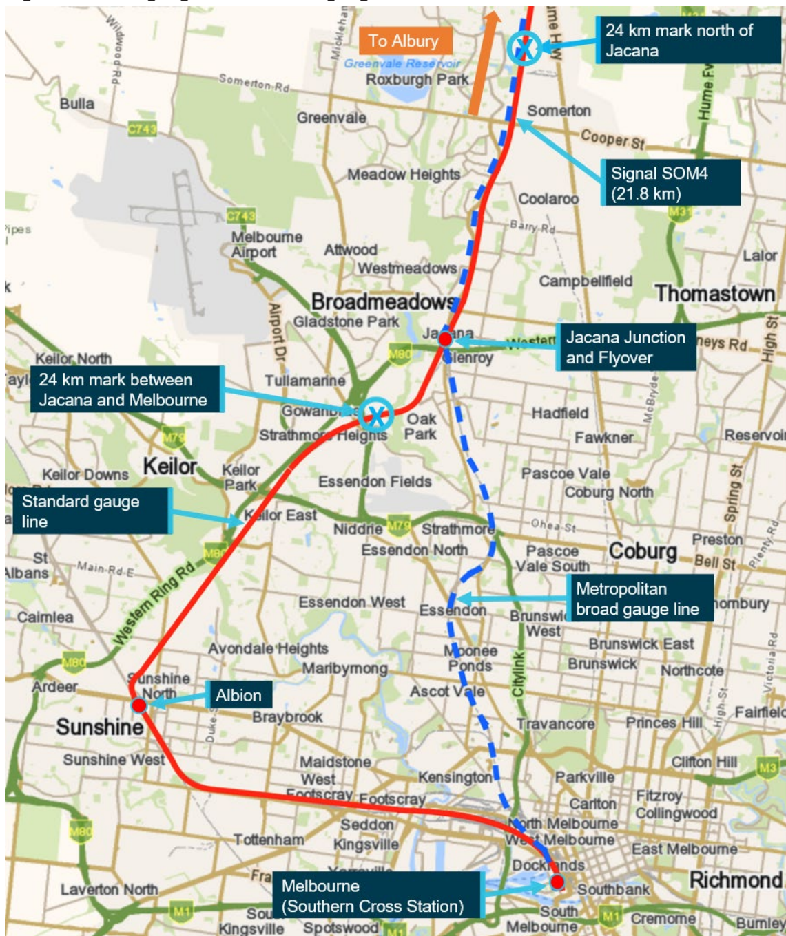
Figure 5: Broad gauge and standard gauge routes to and from Melbourne