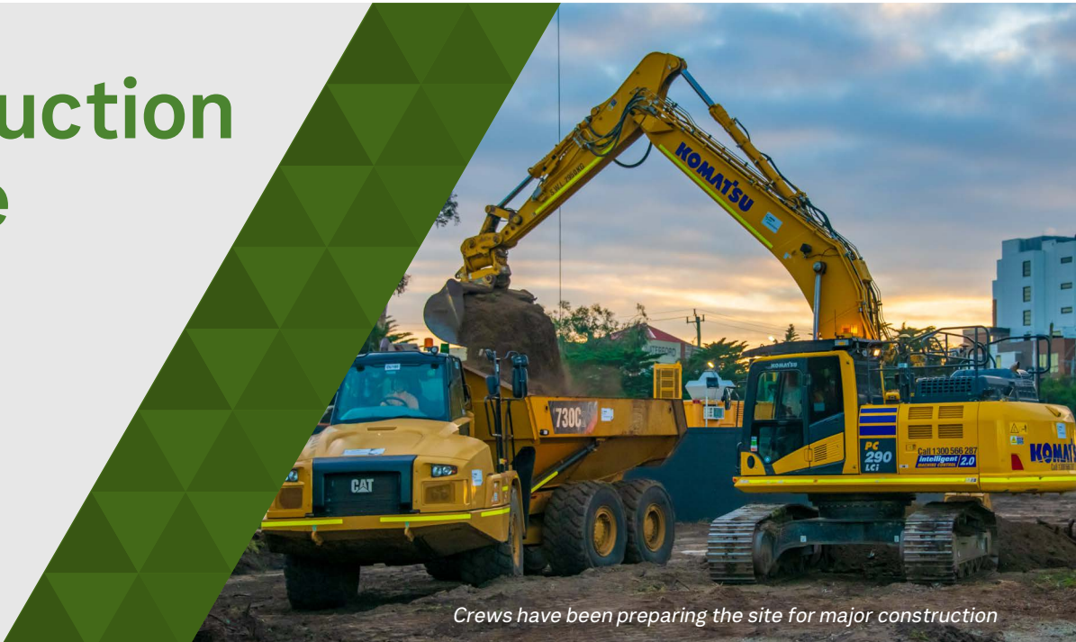
Crews have been preparing the site for major construction

The Victorian Government is building a new tram maintenance and stabling facility for Melbourne’s new next-generation G Class trams on part of the site at 61-71 Hampstead Road in Maidstone.