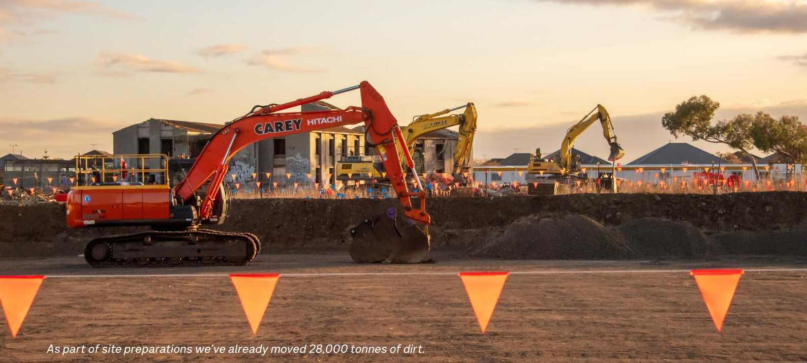
As part of site preparations we've already moved 28,000 tonnes of dirt.