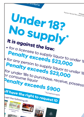
Incorrect Must be aligned and include all content, including the keycode

You can laminate or frame signage providing all content, including the keycode, is clearly visible and not obscured. The signage have been designed with a sufficient margin to allow display in a simple frame.