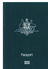
Australian or foreign passport