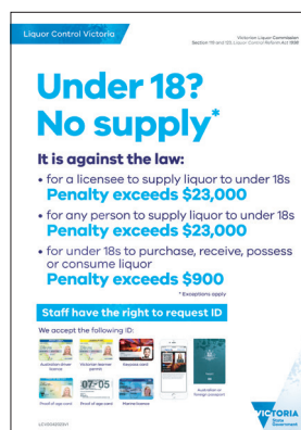
Incorrect Must be clearly printed without blurring or patches